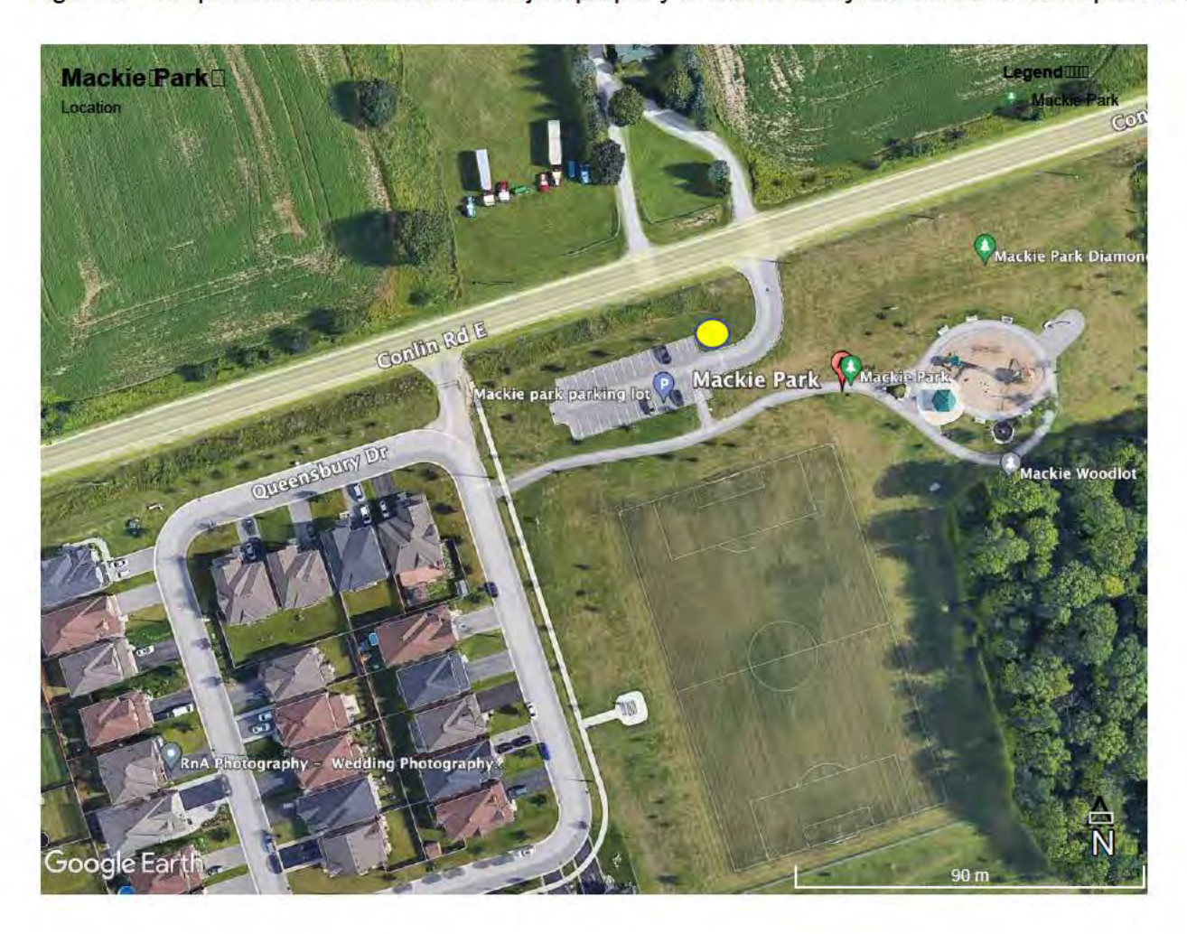
Figure 2 – Proposed tower location on subject property is shown with yellow circle in aerial photo below.

A copy of Rogers' surveyed site plan has been attached for your reference and information.