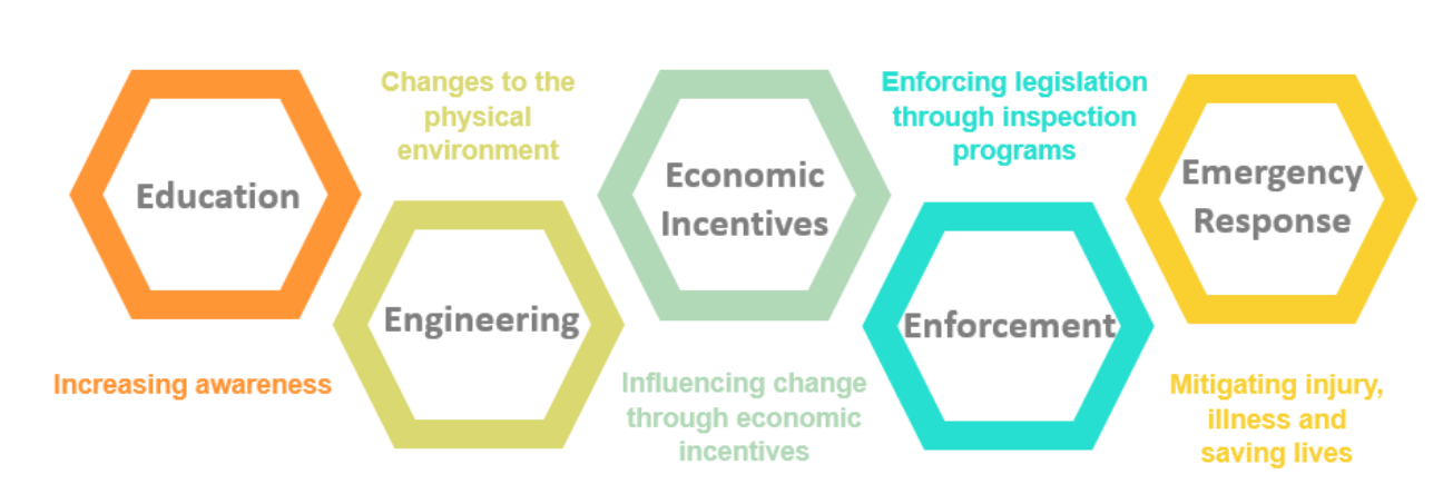
The "Five Es" of Community Risk Reduction

NFPA promotes the use of the Five "E" to reduce community risks: education , engineering , economic incentives , enforcement , and emergency response . In this plan, the OFS has incorporated at least two of these methods in each goal.