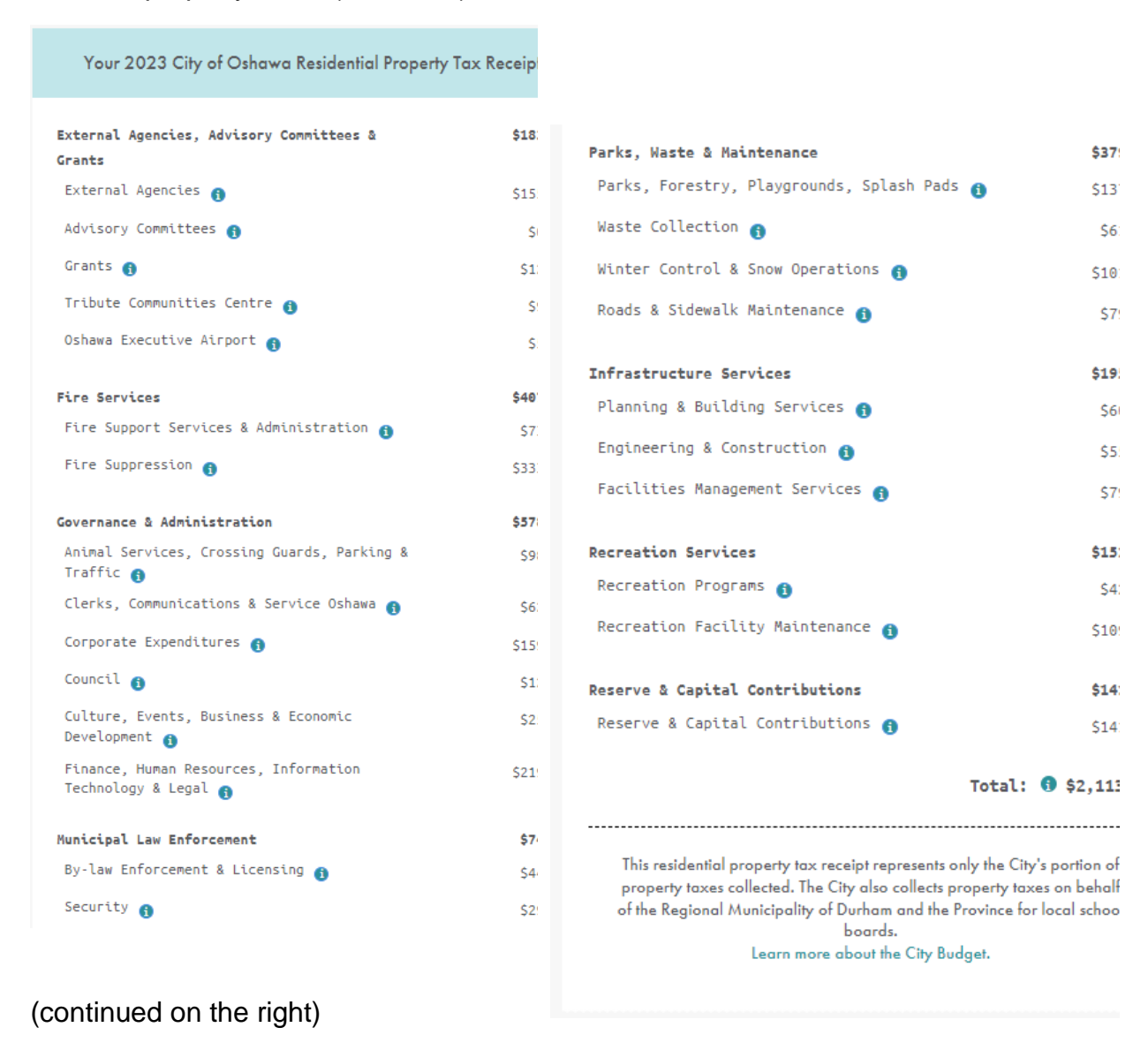
Image is a screenshot of the 2023 Taxpayer Receipt generated with Oshawa's average assessed property value ($356,000).