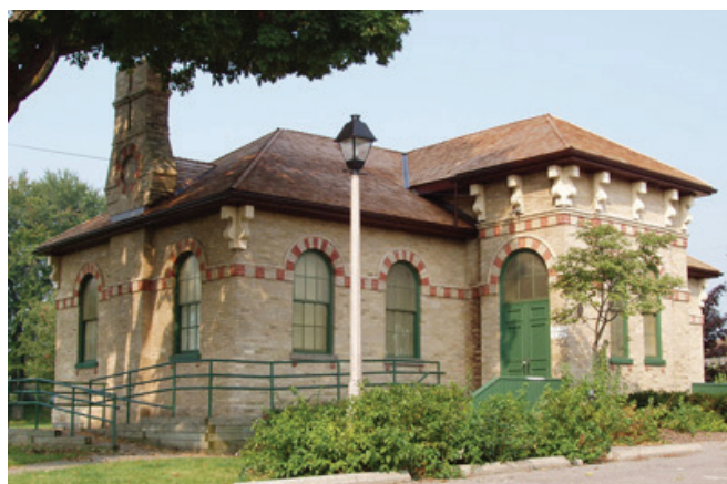
Thornton Dundee Clubhouse, Designated 1999

Cultural Heritage Resources enhance the quality of life for Oshawa citizens by providing a connection to the community's past and creating a sense of place. These historic buildings and landscapes add an economic benefit to the city while contributing to making Oshawa a beautiful place to live.