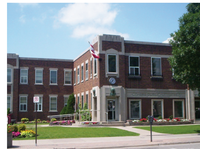
100 Simcoe Street South, Designated 2020

For more information on the Heritage Tax Reduction Program see Oshawa's "Guide to Designated Properties" online at: Oshawa.ca/HeritageTaxReduction