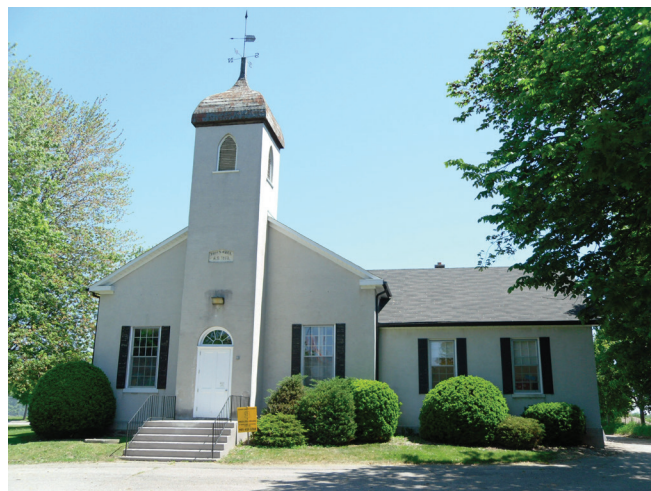
Columbus Community Centre, Designated 2011

Heritage Oshawa meetings are open to the public and viewable online. Our agendas and minutes are also available online. We also have Working Groups that meet less regularly and are project specific.