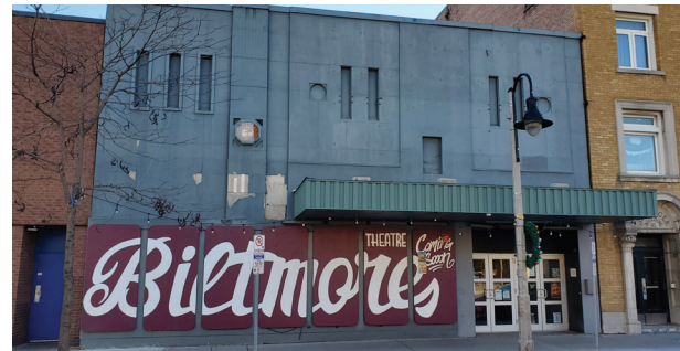
Biltmore Theatre, Designated 2022

Heritage Oshawa works within the guidelines of the Ontario Heritage Act and the Oshawa Official Plan, and is dedicated to keeping Oshawa's heritage alive.