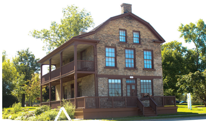
Robinson House, Designated 1989

Cultural Heritage Resources enhance the quality of life for Oshawa citizens by providing a connection to the community's past and creating a sense of place. These historic buildings and landscapes add an economic benefit to the city while contributing to making Oshawa a beautiful place to live.