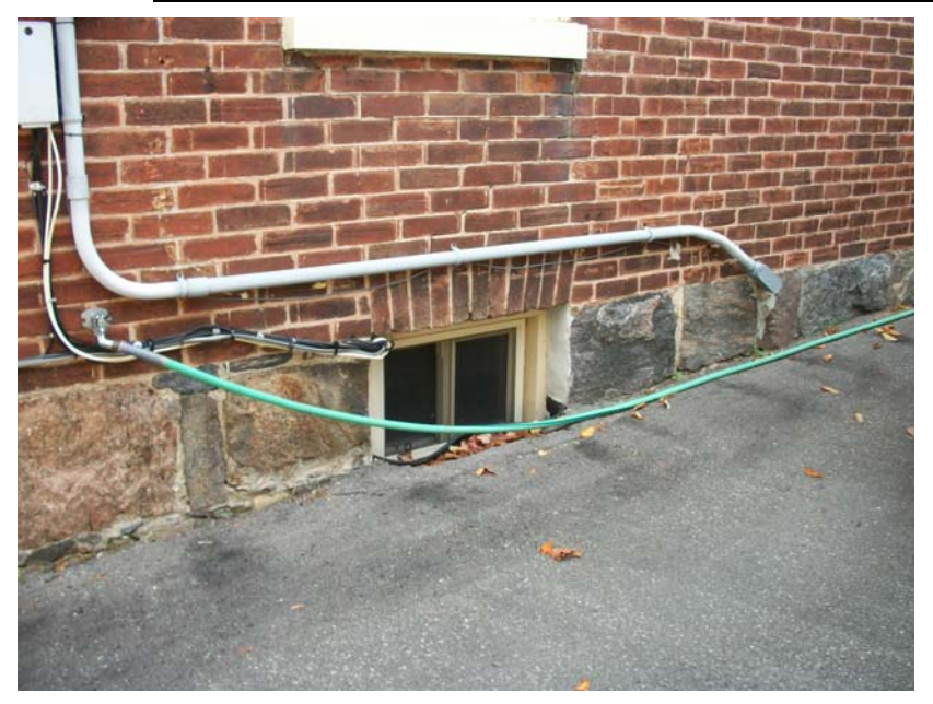
Basement Window, 442 King Street East, September 2010