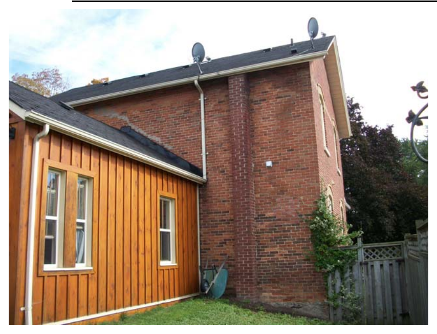
North West Façade, 442 King Street East, September 2010