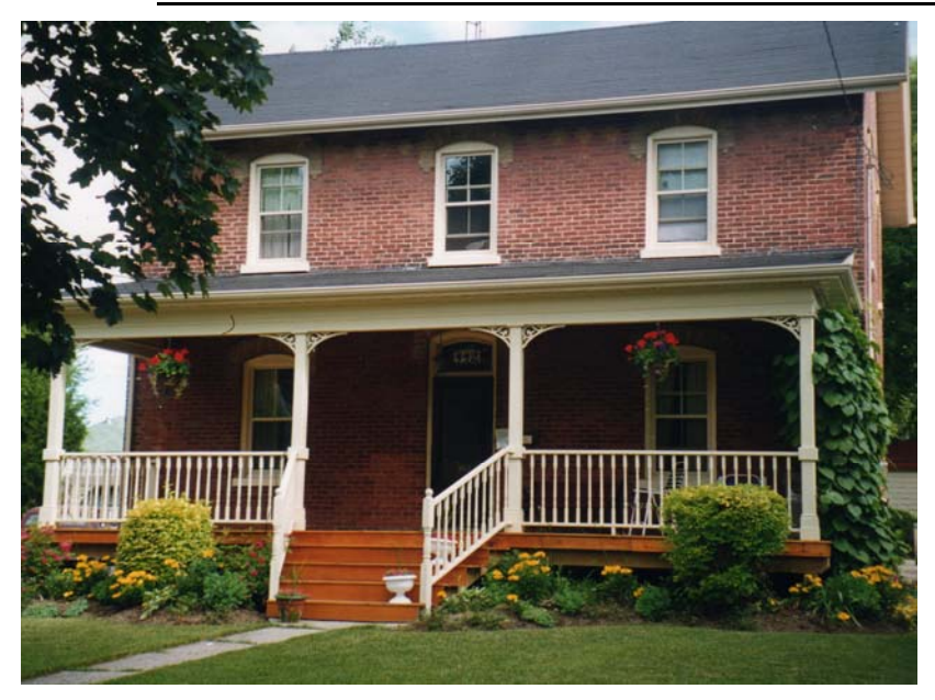
East Façade, 442 King Street East, 1998