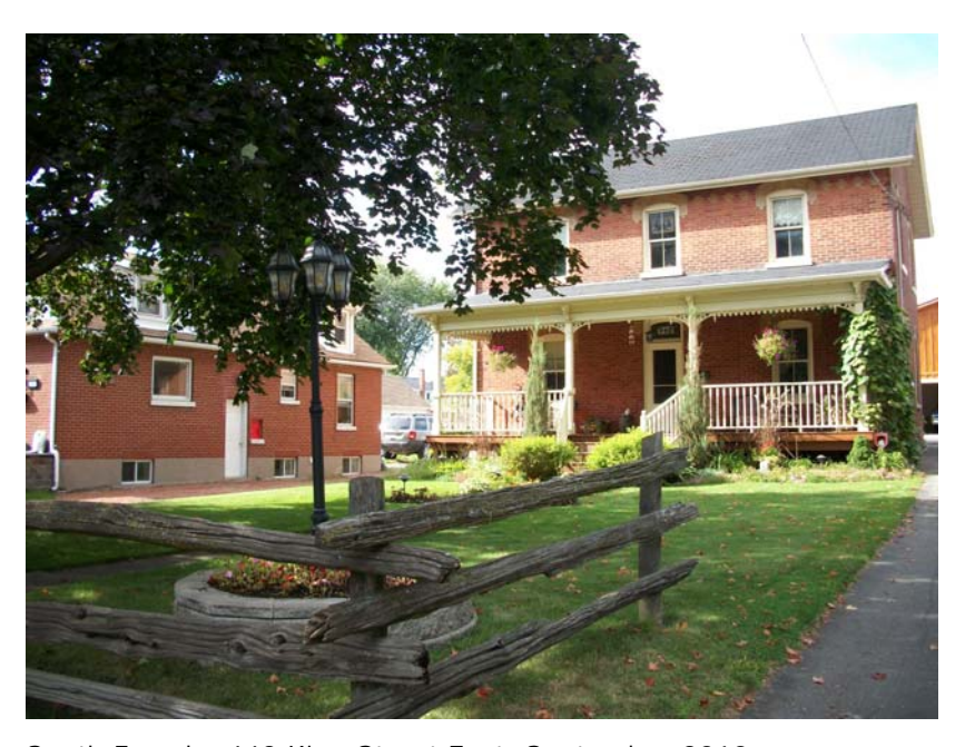
South Façade, 442 King Street East, September 2010