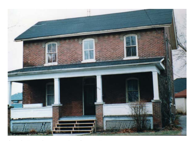
South Façade, 442 King Street East. 1989