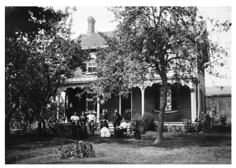
South Façade, 442 King Street East, Oshawa. Circa 1880