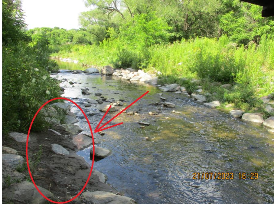
Figure 6: Medium Erosion along Riverbank