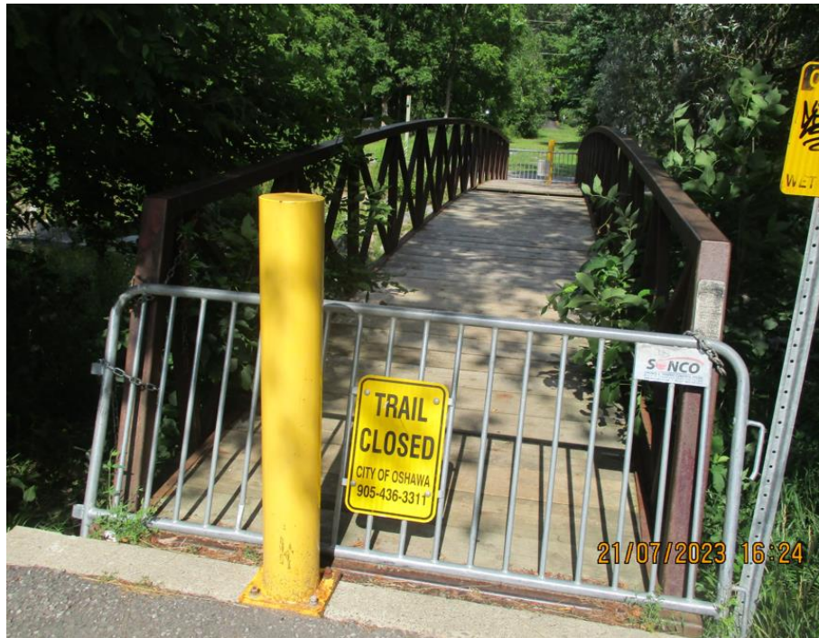
Figure 2: Bridge Closed to the Public