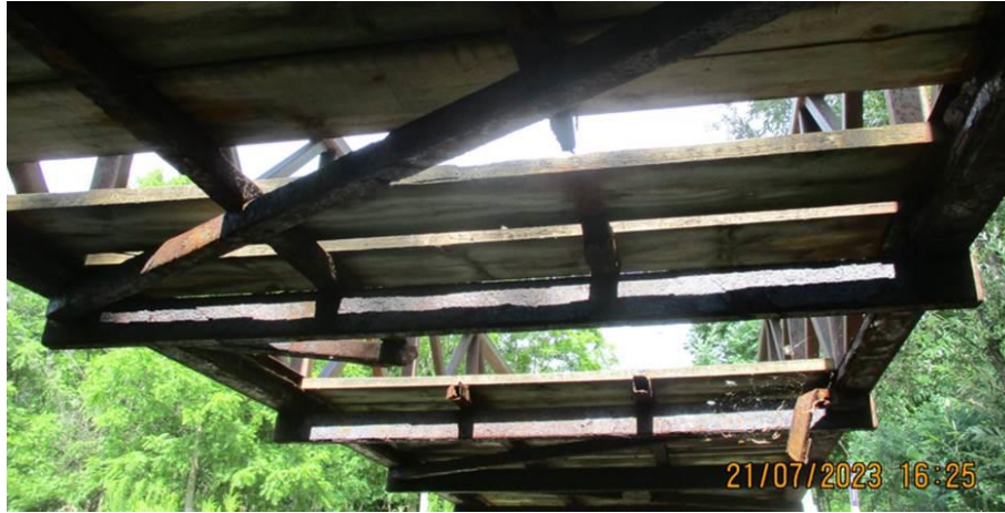
Figure 4: Localized Failure of Bridge Deck Framing and Loss of Planks due to Severe Corrosion- Soffit View