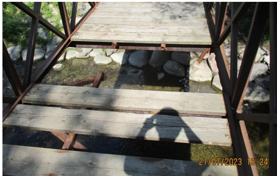
Figure 3: Localized Failure of Bridge Deck Framing and Loss of Planks due to Severe Corrosion- Deck-top View

Upon completion of the close-up (enhanced) inspection of the bridge, it was noted that certain areas of the deck (full width) have completely failed due to severe corrosion of steel superstructure elements (main beams, transverse beams, diagonal bracings). It was further noted that the plank insert section of the peripheral stringers are also fully perforated, thus resulting in a lack of any support for certain planks and unsafe support for the rest. Figures 3 to 7 below further illustrate some of the noted deficiencies.