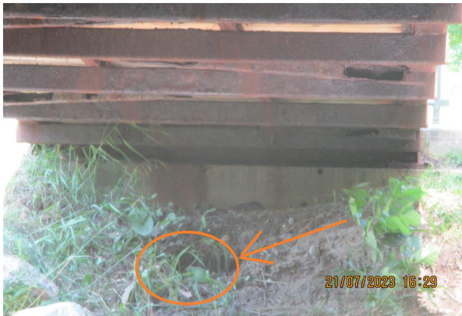
Figure 7: Medium to Severe Erosion along Riverbank (Abutment Embankment)