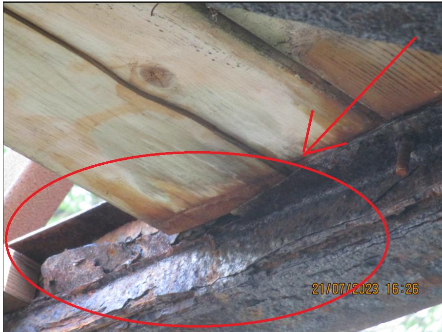
Figure 5: Severe Corrosion and Failure of Plank Insert Support at Peripheral Stringers