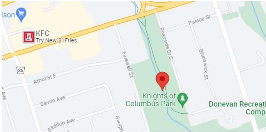
Figure 1: Key Plan: Fawcett Park Pedestrian Footbridge Over Harmony Creek (Site # MS-4-2023)