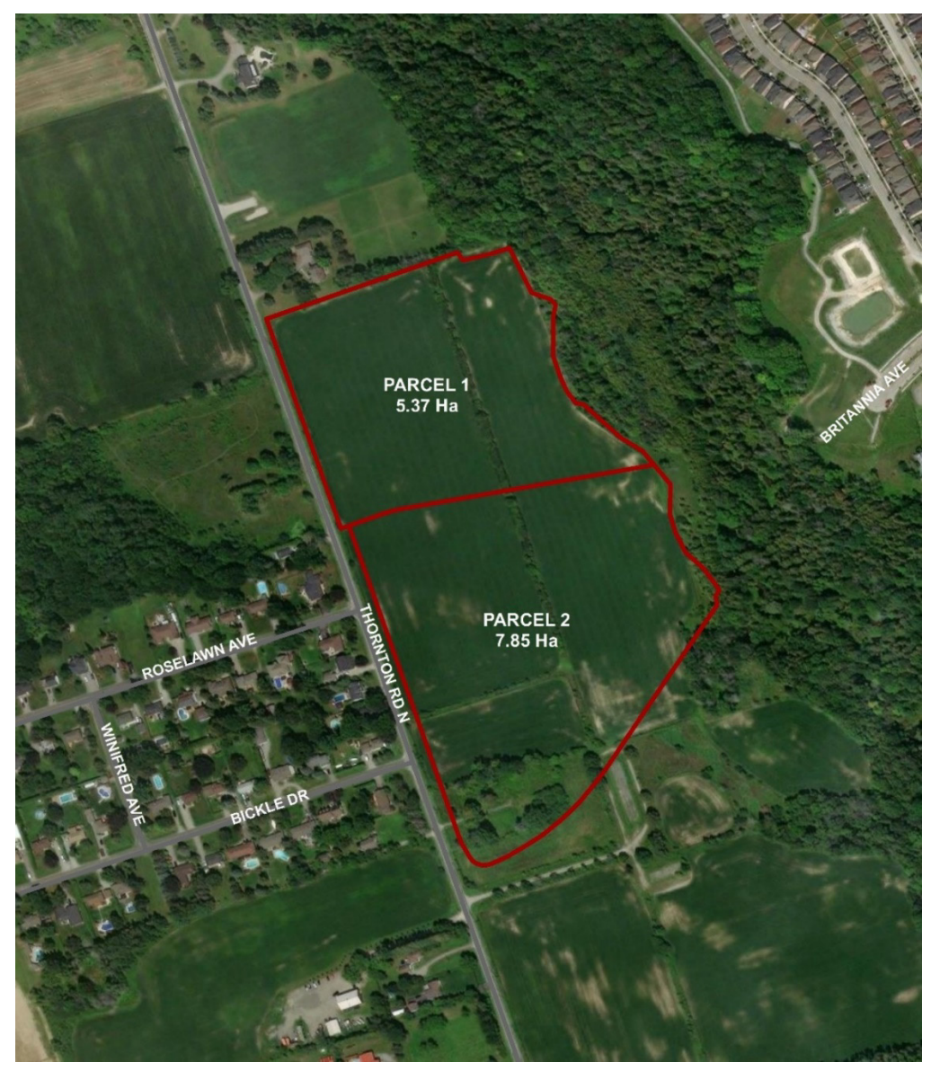
Figure 1: Future Northwest Community Centre & Windfields Community Park Site

The future northwest community centre will be integrated as part of the 13.2 hectare (33 acre) Windfields Community Park block. The Community Park consists of two contiguous parcels (Figure 1) situated along the Thornton Road North corridor at its northeast intersection with the future Britannia Avenue West extension, placing it between Winchester Road/Highway 407 to the north and Conlin Road to the south. The site is located outside of, but in proximity to the Windfields Part II Planning Area's western boundary. Surrounding lands are zoned for Industrial, Agricultural and Open Space uses while there is a small residential subdivision on the west side of Thornton Road North.