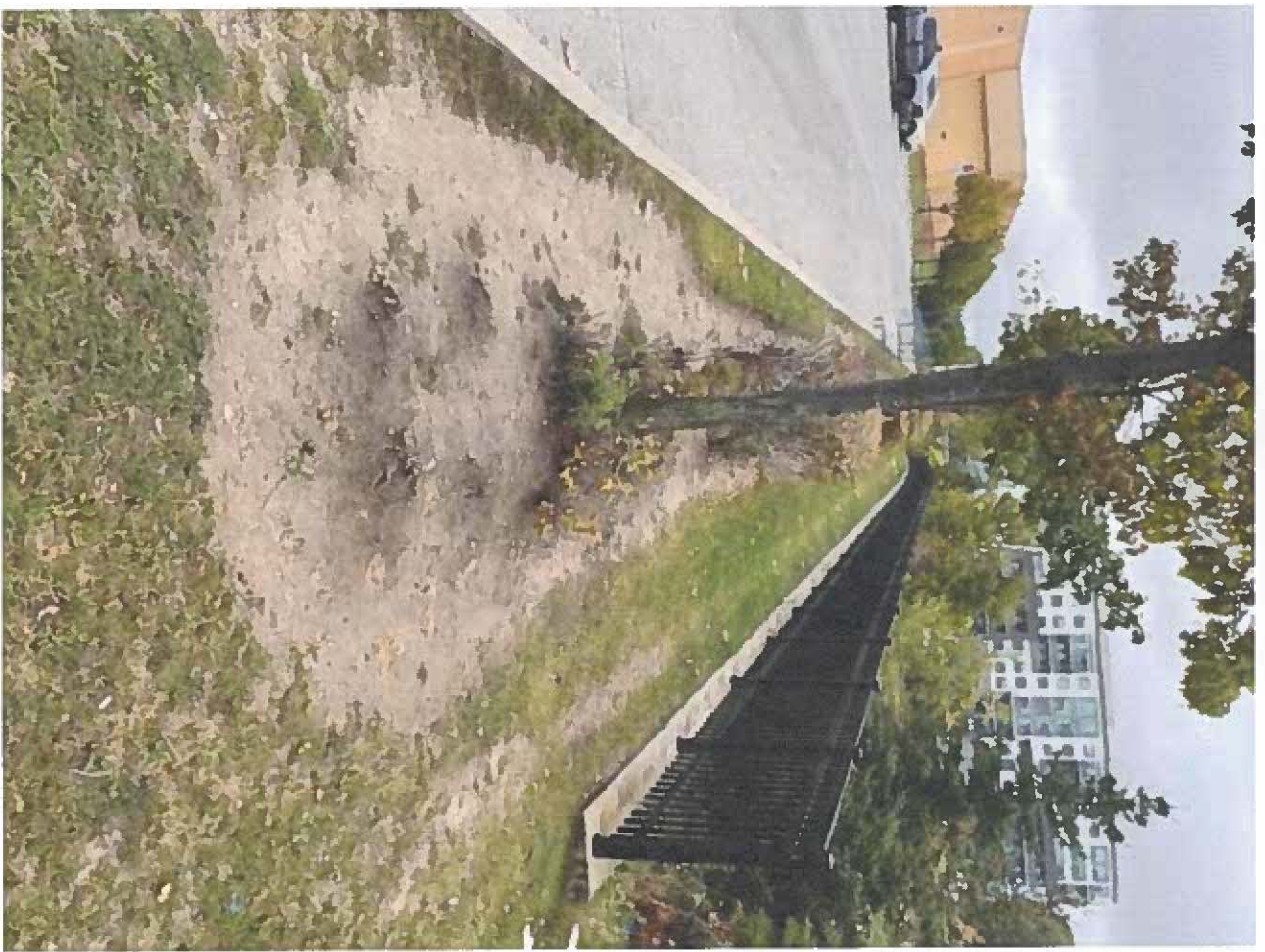
Space of paved walkway...note the flatness