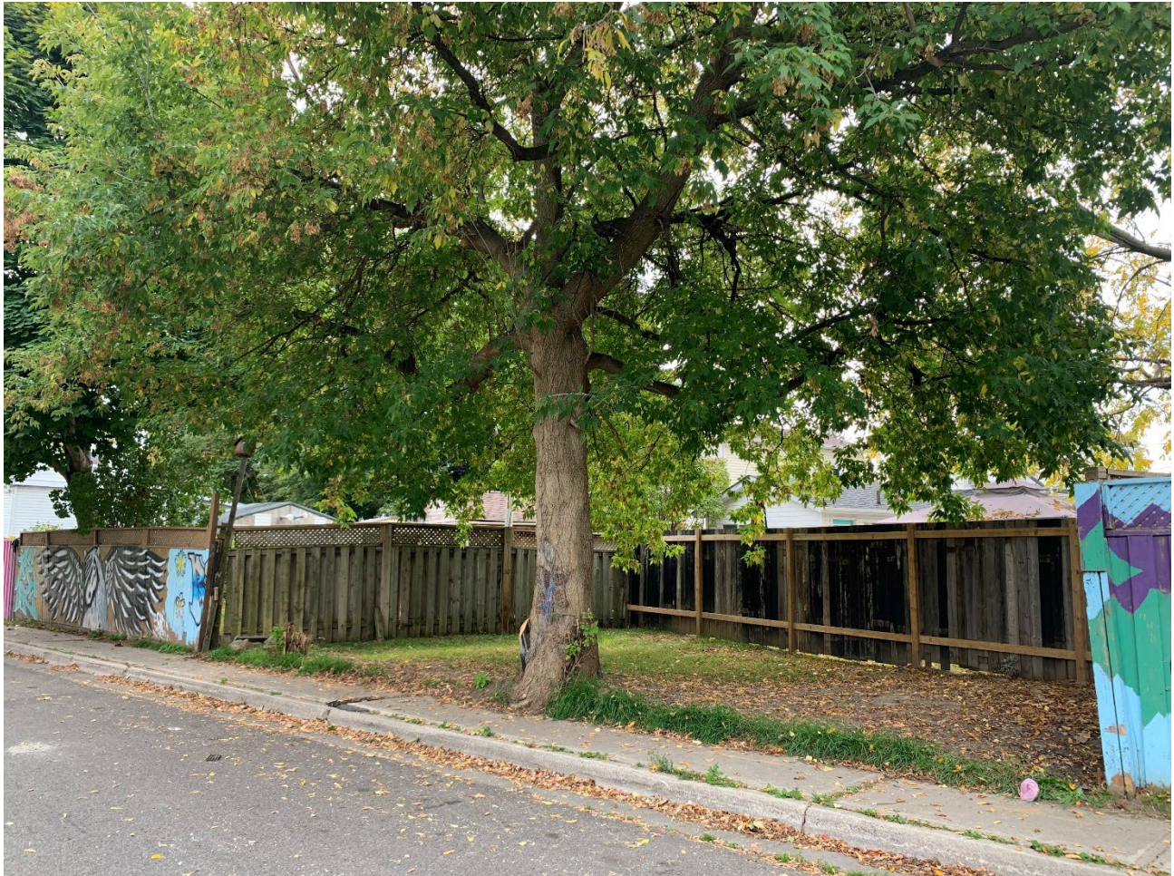
Photo of the Subject Site